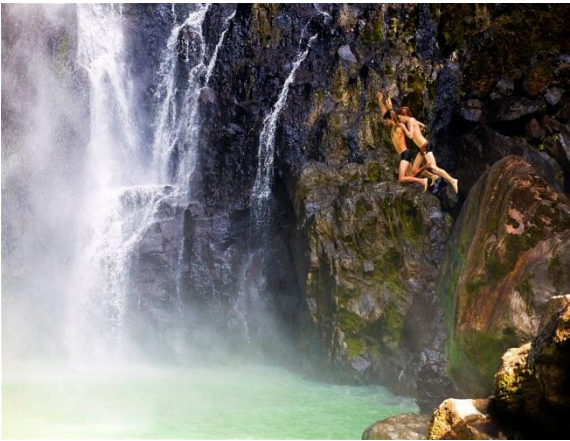
Two people jump into the pool at the foot of Victoria Falls.

Halfway between Guadeloupe and Martinique, Dominica is the only place in the Eastern Caribbean that’s still home to a sizeable population of indigenous people, the Kalinago, who've lived on the island since the 13th century.