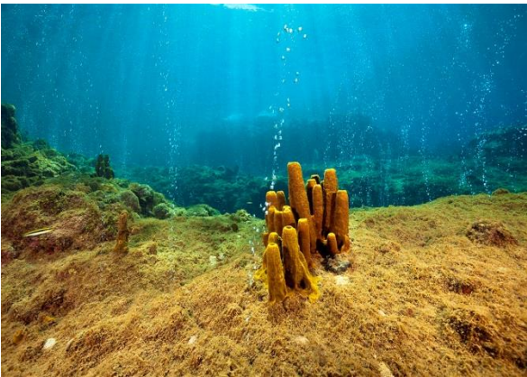
Volcanic air bubbles at Champagne Reef