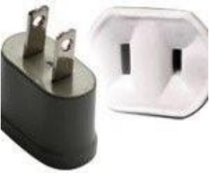
Type A: This socket has no alternative plugs

In Dominica the power sockets are of type A, B, D and G. Type G is predominant - this type is of British origin. This socket only works with plug G (See pictures below).