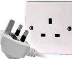
Type G: This socket has no alternative plugs

Dominica has a modern and reliable telecommunications system. It is easy to find public phones in the city and in most communities. Hotels offer International Direct Dialing from their rooms.