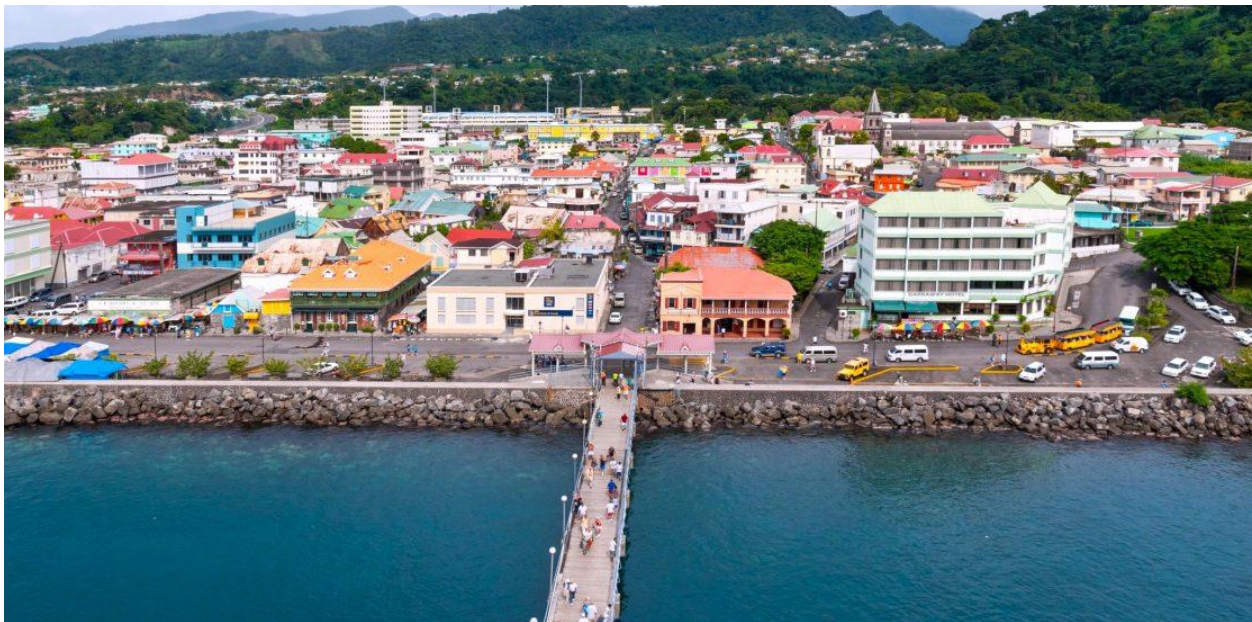
Part of the capital Roseau

English is the official language of Dominica; however a large portion of the population speaks Kwéyòl, which is based primarily on French and Carib vocabularies and a syntax borrowed from a variety of West African indigenous languages. A few northern villages use a distinctive English dialect called Kokoy. For the past decade, pre-Hurricane Marie, population was hovering around 69, 625 (2006 estimate)but this has diminished with an estimated 15,000 having emmigrated after the devastation of Hurricane Maria.