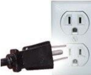
Type B: This socket also works with plug A