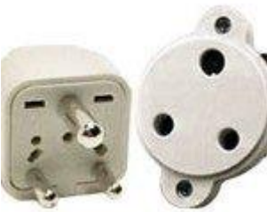
Type D: This socket has no alternative plugs