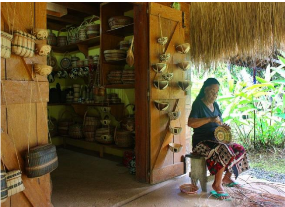
Kalinago woman weaving a basket