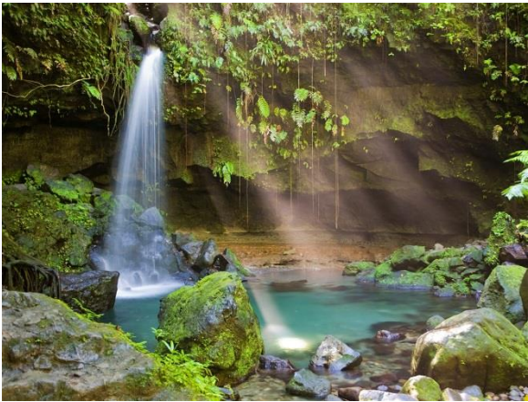
The waterfall at Dominica's picturesque Emerald pool.