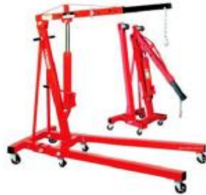
Foldable Hydraulic Engine Hoist