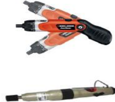
Pneumatic screwdriver and Electric screwdriver