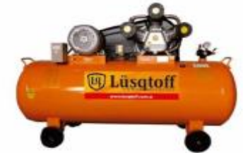
3 phase air compressor