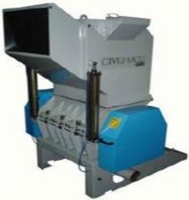
Recycling grinding machine