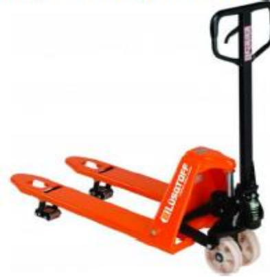
Hydraulic pallet truck