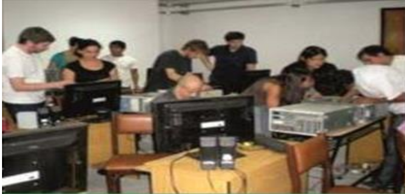
Alumnos Fac. Informática