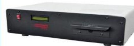
Demagnetizer Hard Drive