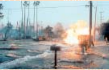
Gas escaping from a broken pipe burns as water from a ruptured main floods a Los Angeles street after an earthquake