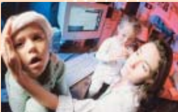
Mother with a sick child consults a doctor via a webcam

Through its work on standardization, ITU develops technical standards (known as recommendations) that facilitate the use of public telecommunication services and systems for communications during emergency, disaster relief and mitigation operations. This capability, referred to as the emergency telecommunication service, enables authorized users to organize and coordinate disaster relief operations as well as have preferential treatment for their communications via public telecommunication networks. This preferential treatment is essential as public telecommunication networks often sustain infrastructure damage which, coupled with high traffic demands, tends to result in severe congestion or overload to the system. In such circumstances, technical features need to be in place to ensure that users who must communicate at a time of disaster have the communication channels they need, with appropriate security and with the best possible quality of service.