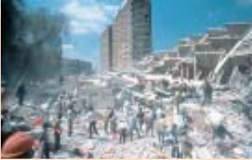
Earthquake in Mexico Source: Actualités Suisse .