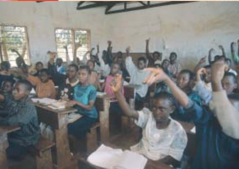
Refugees from Rwanda and Burundi, Mkugwa Camp, Kibondo, Tanzania

The International Telecommunication Union (ITU), in partnership with the United Nations High Commission for Refugees (UNHCR) and the United Nations Educational, Scientific and Cultural Organization (UNESCO), has established a network of three multipurpose community telecentres (MCTs) in and around refugee camps along the northwestern border of Tanzania.