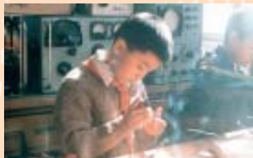
Caption: A young Chinese student prepares electronic equipment for amateur radio purposes. Amateur radio operators are important players in disaster communication.