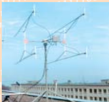
Antenna of an amateur radio station on the ITU building roof in Geneva