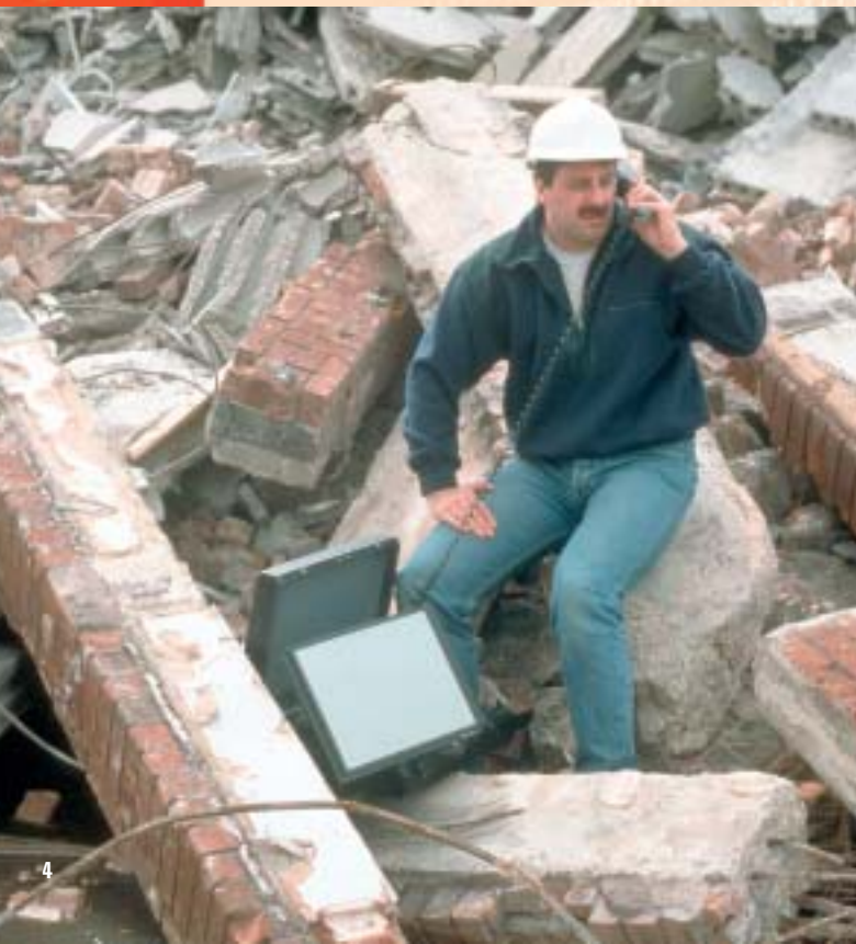
Satellite telephone equipment being used in a disaster