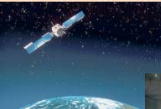
Inmarsat II satellite