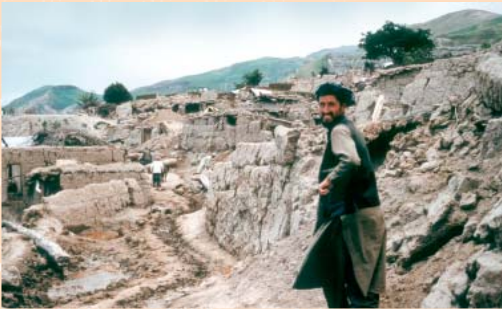
A devastating earthquake hits Afghanistan