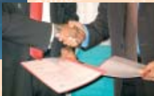
ITU and Inmarsat Limited partner to provide Satellite Services for Disaster Relief and Rural Telecommunications in Least Developed Countries