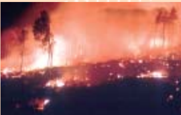
Forest fire in South Africa

Disasters kill at least one million people each decade and leave millions more homeless.