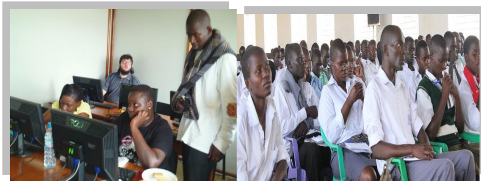
WOUGNET'S ICT youth works in Uganda