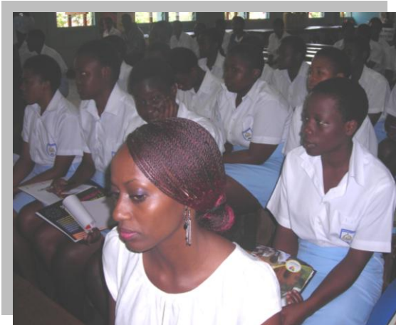
The participants at the event