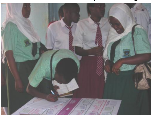
Student's from PMM Girls Sch. Jinja registering