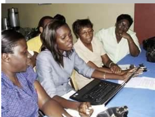
Women's ICT empowerment