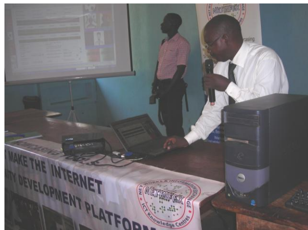
Participants at the ICT Exhibition during a demonstration