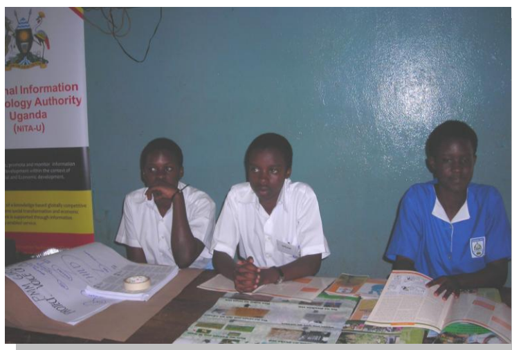
Registration Desk at the Girls in ICT Day 2012