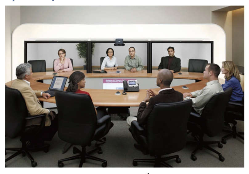
Figure 1: A sample Telepresence studio

Source: Cisco Telepresence 3000 virtual conference table<sup>1</sup>