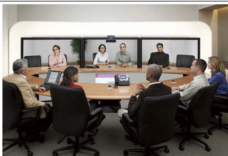
Figure 1: A sample Telepresence studio

This report, the second in the Technology Watch Briefing Report series, looks in more detail at the second of these trends, namely the development of high-performance, studio-based video conferencing or “ Telepresence ”. Such systems are already available on the market, and vendors have identified the technology as a potential billion US dollar market 2 .