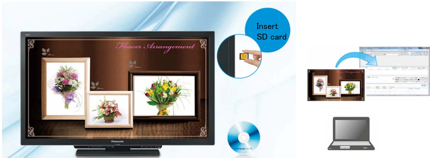
LCD Display TH-37LRV30J