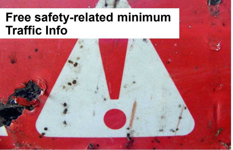
Free safety-related minimum Traffic Info