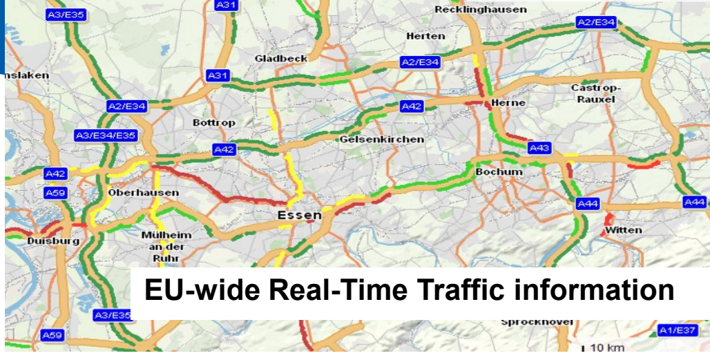
EU-wide Real-Time Traffic information