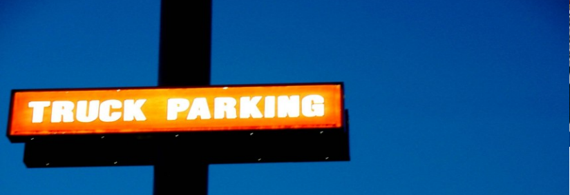
Information & Reservation systems for Truck Parking