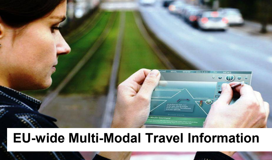
EU-wide Multi-Modal Travel Information