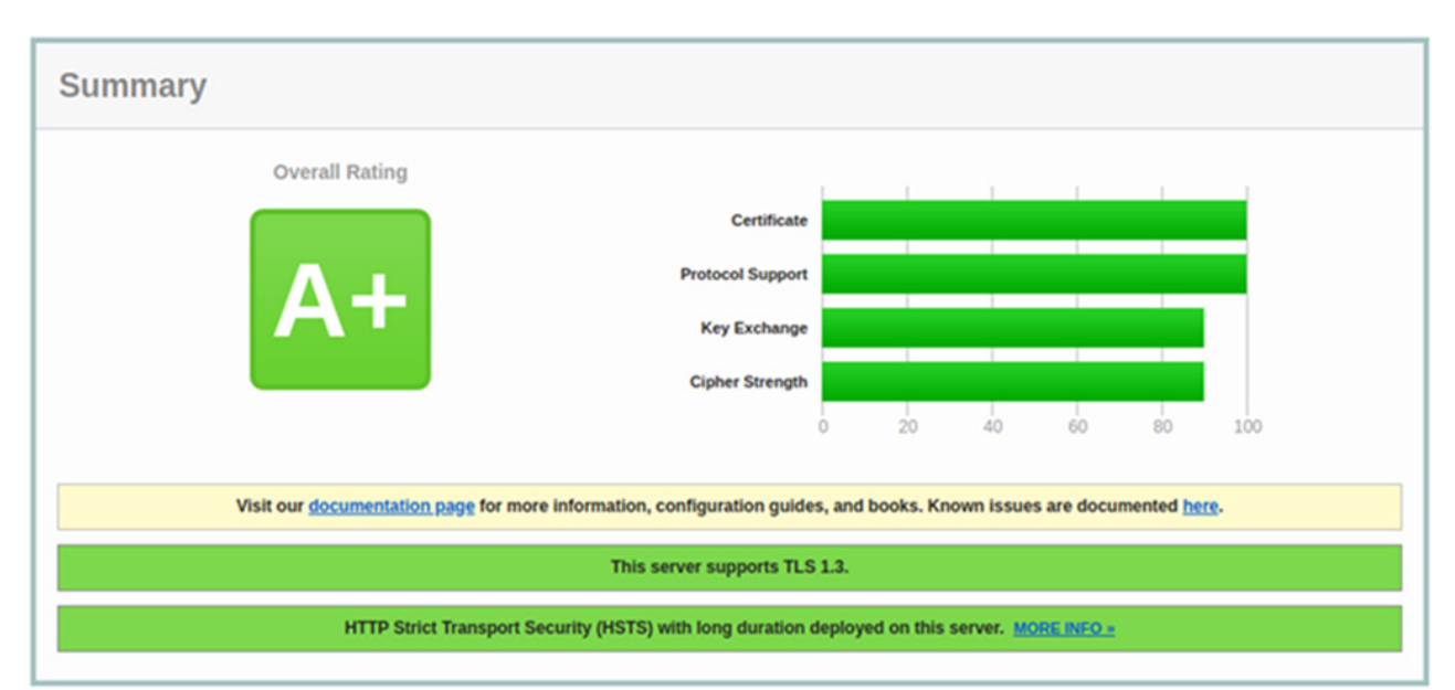
Figure 3 - SSL configuration assessment of app3's server

T1.4 We did not find inappropriate Android permissions in the manifest.