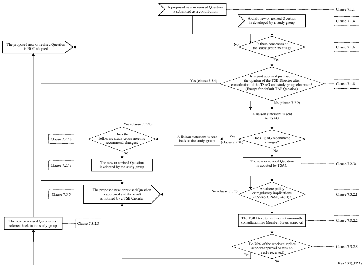
Figure 7.1a – Adoption and approval of new or revised Questions between WTSAs

7.2.2 TSAG shall be made aware by liaison statement from the study groups of all proposed new or revised Questions, in order to allow it to consider the possible implications for the work of all ITU-T study groups or other groups. TSAG shall review and, if appropriate, may recommend changes to these Questions, taking into account the criteria listed in 7.1.5 above.