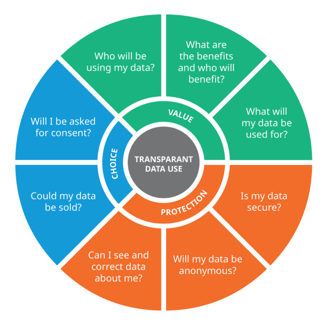
Figure 2 – Elements of transparent data use [280]

Although the guidelines are voluntary, each entity that seeks to use the data has been asked to publish answers to these questions so that the individuals who provide the data can determine whether the values of the entity align with their preferences [280].