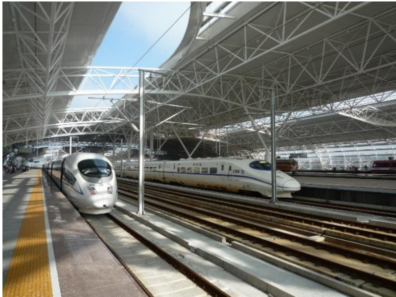
FIGURE 7 Railway station