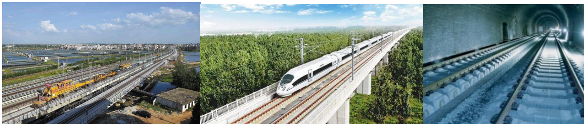
(a) Parallel railway lines