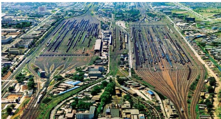
FIGURE 8 Shunting mixed with railway lines

In shunting mode 6 , the typical applications may include voice and alerting data mixed transmission, monitoring. (Source: FRS 8.0.pdf 7 )