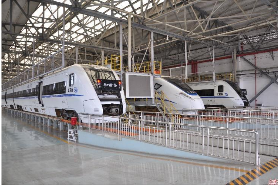
FIGURE 9 Maintenance Base

The operating scenario of RSTT in the maintenance bases is similar to that of in railway stations. In this scenario, RSTT need to support the following applications: monitoring, maintenance information (Source: FRS 8.0.pdf).