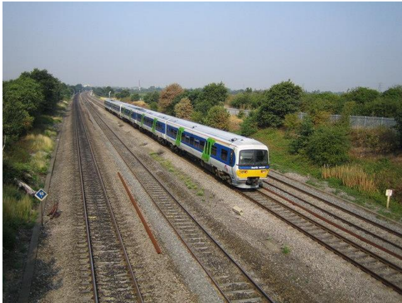
FIGURE 5 Railway lines

In addition, there are several specific operating scenarios of railway lines, e.g. parallel railway lines, viaducts and tunnels, etc.