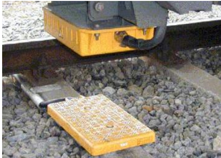
FIGURE 3 Example of railway balise