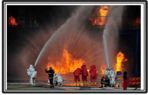
FIGURE 1 Picture showing front side of the factory on fire

injured, and still more than 10 persons are trapped in the building (Fig. 1). The factory is situated in an industrial area just outside the city. The buildings on fire are about 100 metres from a gas tank containing the highly toxic methyl isocyanate and the connected production facility for this gas at the plant. The tank is located directly behind the building on fire and the fire is spreading fast towards the tank area (Fig. 2).