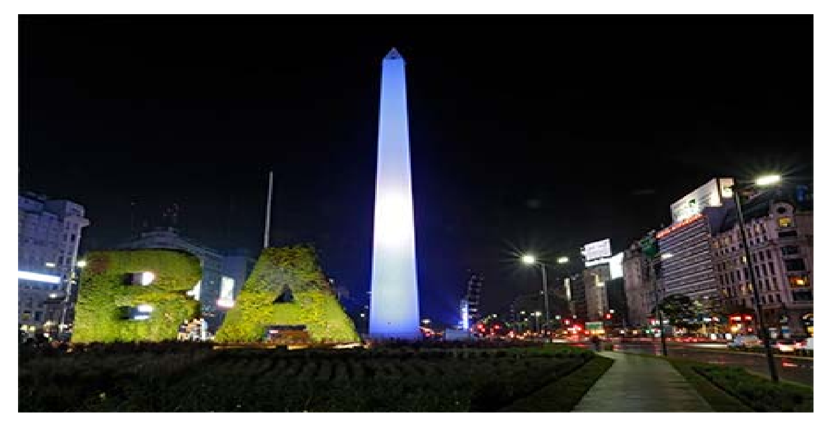
We are waiting for you!!! .....in Buenos Aires!