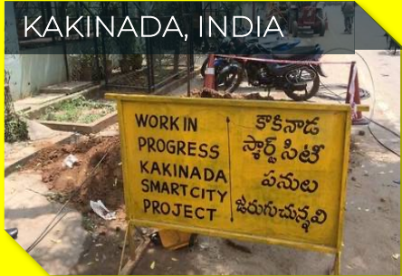
Focus on Tech, Not People