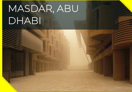
Gaps in Supply-Side Master Planning