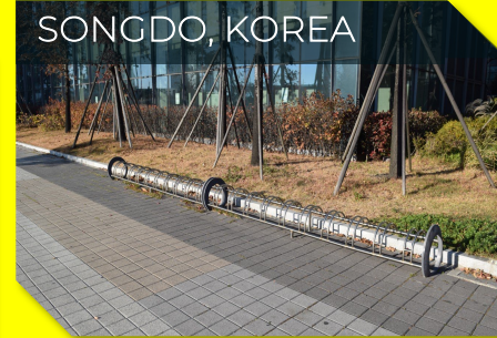
Liveable, Not Loveable