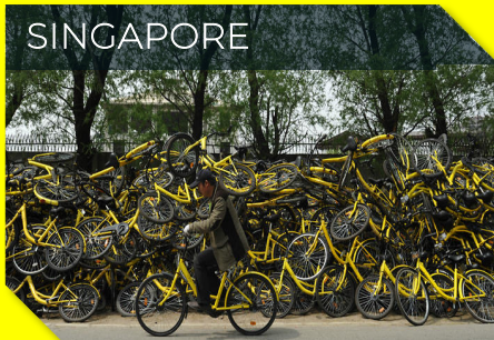
Weak Operating and Business Model