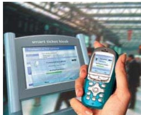
NFC-enabled phone and ticket terminal

NFC is already standardized in various bodies like ISO/IEC (18092 114 , 21481), ECMA (340, 352 and 356), ETSI TS 102 190.