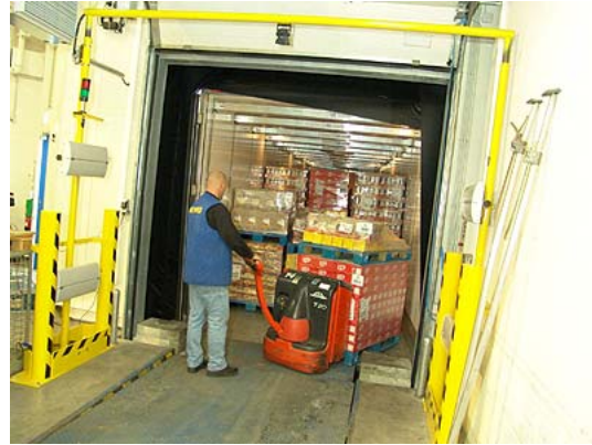
RFID-tagged pallets in a store in Neuss

Analysts expect to see a tremendous development of the worldwide RFID markets in coming years and foresee growth rates in double-digits. Nevertheless, there are dramatic differences between forecasts on how much the market will grow. A recent study by Frost & Sullivan 22 estimates revenues to grow to 11.7 billion USD by the year 2010. But, a new study published by Research and Markets 23 is a little less enthusiastic, predicting revenues of just 3.8 billion USD in 2011. To achieve this, the researchers estimate the average market growth to be 67 per cent per year. Another study published by IDTechEx 24 in spring 2005 sees continuing growth, and predicts 26.90 billion USD in 2015.