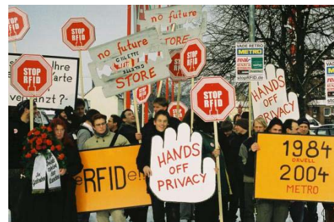
Demonstration against RFID equipped supermarket (Metro's Future Store)

A main privacy concern, of importance namely in business-to-consumer (B2C) relations, is the ability of RFID systems to track persons and goods without consent. Because RFID tags are getting smaller and smaller, it is easily possible to hide tags in such a way that consumers are unaware of their presence. This could be an attractive option to businesses as they would be able to profile and identify consumer pattern and behaviour. In recent years, RFID technology has encountered massive criticism by various consumer groups such as Consumers against Supermarket Privacy Invasion and Numbering 30 (CASPIAN), Electronic Privacy Information Centre 31 (EPIC) or the Electronic Frontier Foundation (EFF) 32 . In a statement issued in November 2003 33 , various consumer groups have requested a moratorium on the use of RFID technology in consumer products to provide enough time to assess the impact of the technology. Companies using RFID technologies like Benneton 34 , Gillette 35 or Tesco 36 faced consumer boycotts.