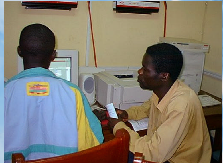
Nakaseke, MCT, Uganda