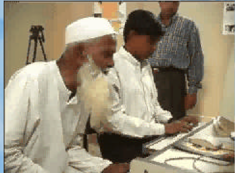
Muhammad Yunus Founder Grameen Bank