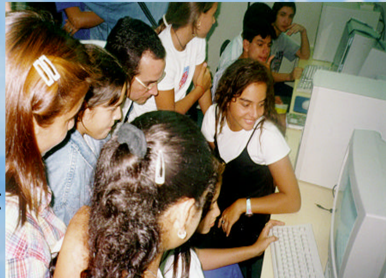
Children at the opening of an Amic@s in Paraguay