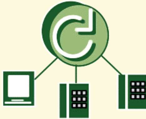
FIGURE 2 Centralized Architecture