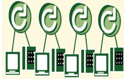
FIGURE 3 Horizontal Architecture