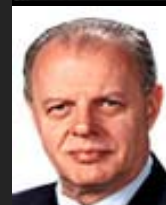
Prof. Howard Schmidt Former White House Security Advisor, Former Chief Security Officer of Microsoft and eBay