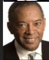
John W. Thompson Chairman Symantec Corp.