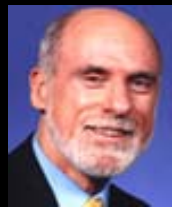
Dr. Vinton Cerf Chief Internet Evangelist of Google, 'Father of the Internet'

IMPACT's International Advisory Board comprises a distinguished list of renowned experts from industry and academia