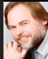
Eugene Kaspersky Founder & CEO of Kaspersky Lab