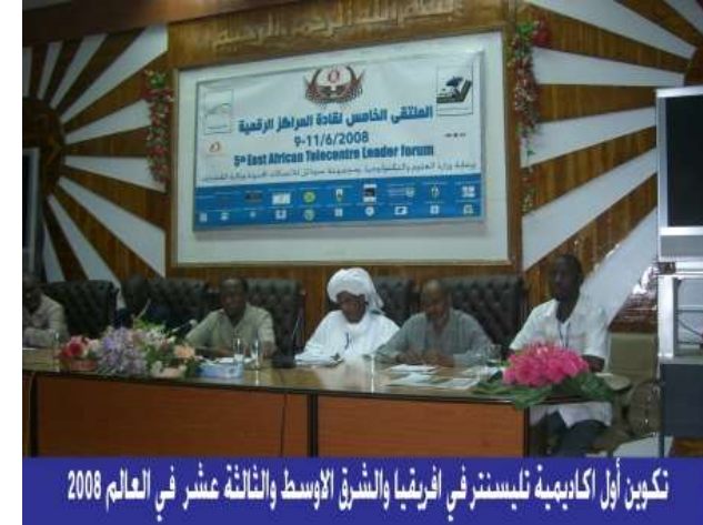
تكوين أول أكاديمية تليسنتر في افريقيا والشرق الأوسط والثالثة عشر في العالم 2008