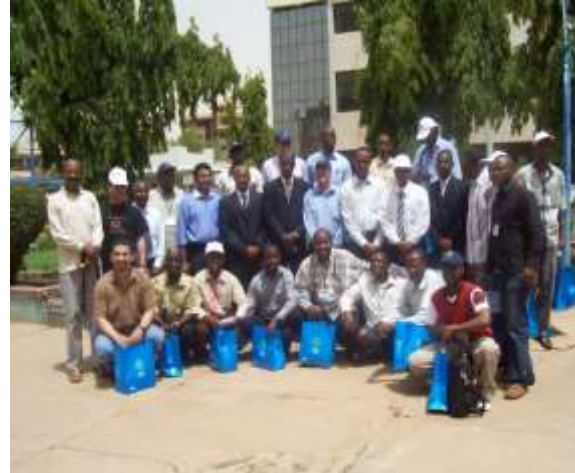
5 th EATLF Participants visit to Sudacad