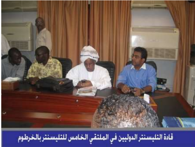
قادة التليسنتر الدوليين في الملتقى الخامس للتليسنتر بالخرطوم