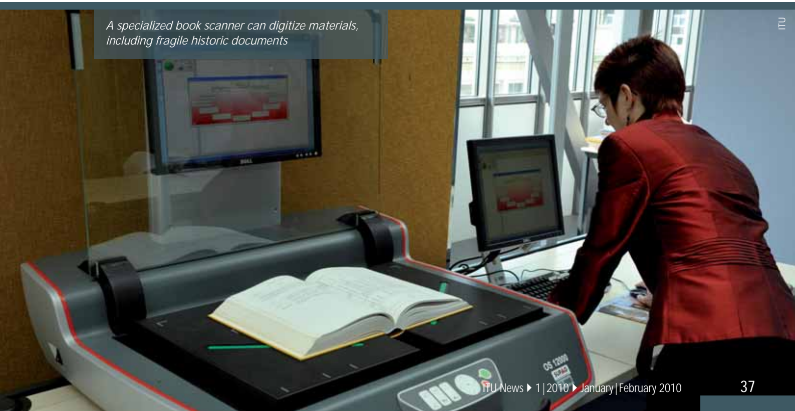
A specialized book scanner can digitize materials, including fragile historic documents