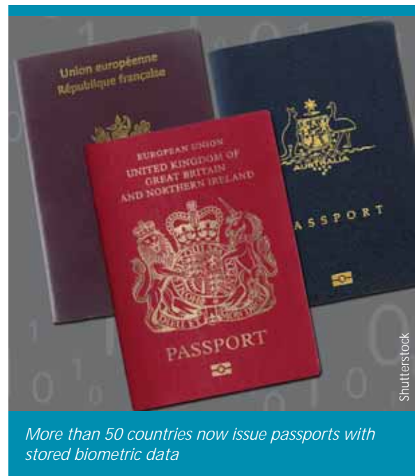
More than 50 countries now issue passports with stored biometric data

Biometrics are increasingly used to complement or replace traditional authentication schemes such as personal identification numbers (PIN) or passwords. But biometric data cannot be kept secret. Photographs of faces, recordings of voices and copies of signatures, for instance, are all easily made.