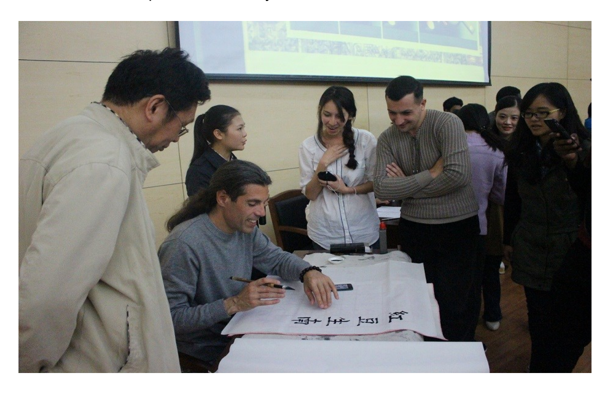
Handwriting of Chinese Calligraphy by International Students