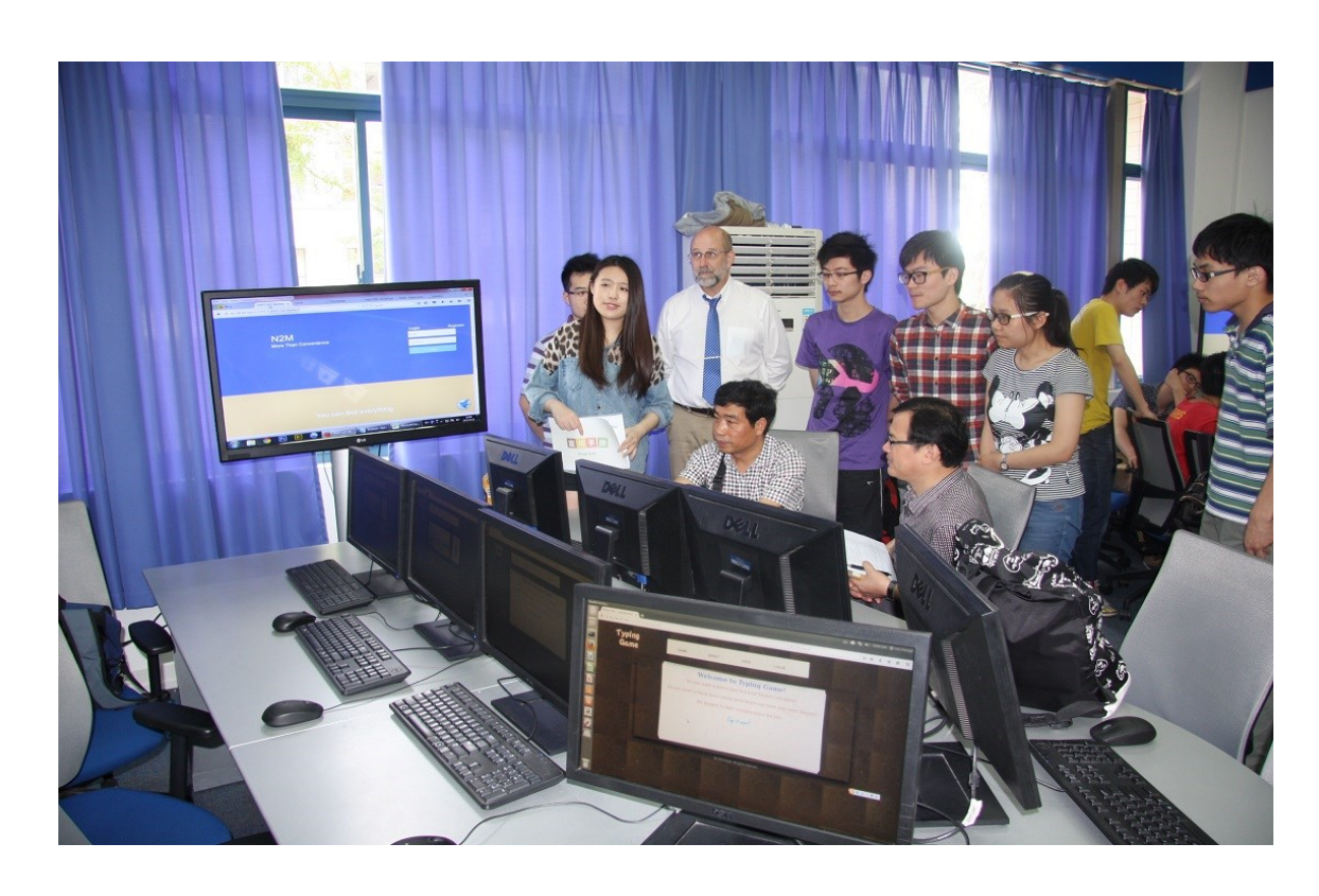
Computer Lab Built by NUPT and a U.S. Institute