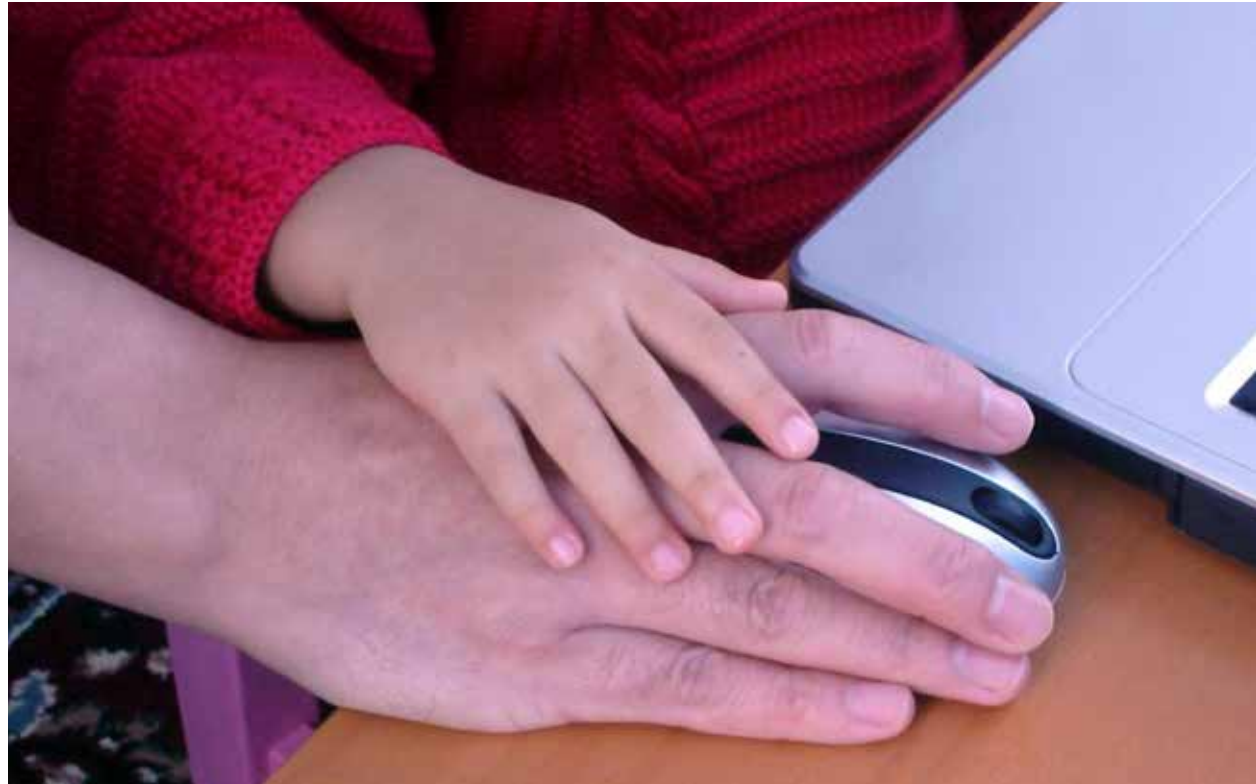
Table 4 provides guidance for content providers, online retailers and applications developers on policies and actions they can take to enhance child online protection and participation.

The Internet provides all types of content and activities, many of which are intended for children. Content providers, online retailers and app developers have tremendous opportunities to build safety and privacy into their offerings for children and young people.