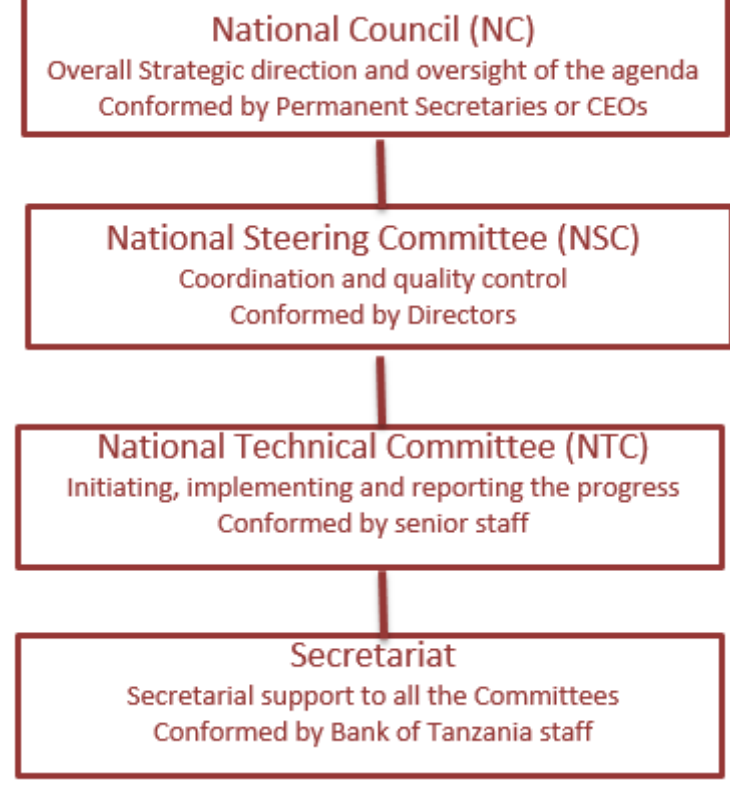
Figure 2: Tanzania's Financial Inclusion Coordination Structure

Pakistan also framed its NFIS in mid-2015, with a well-structured council, steering committee and technical committees/groups. This country's experience to date is that the achievement of its NFIS targets depends crucially on effective cooperation between financial and telecom regulators, financial institutions, mobile network operators and solutions providers.