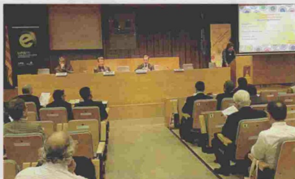
En aquest congrés hi participen els millors experts del món tant universitari com empresarial

Des de dimecres i fins divendres, s'imparteixen una trentena de ponències, a més de conferències magistrals i presentacions convidades a càrrec dels millors experts de tot el món, tant de l'entorn