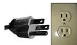
B, NEMA 5.