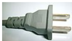
A, NEMA 1.