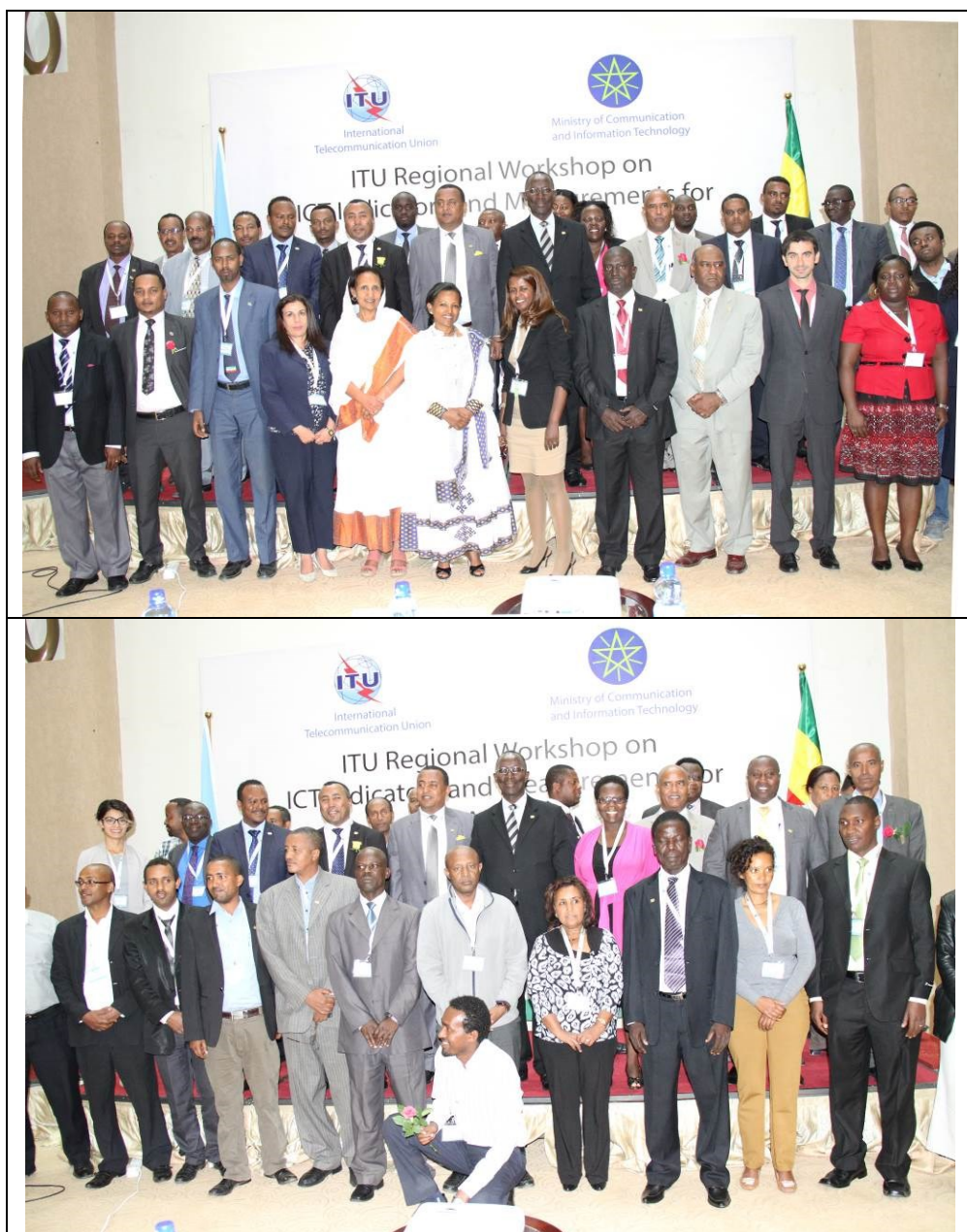
Group pictures of the workshop participants.

The workshop was attended by 140 participants representing 14 African countries (Burundi, Ethiopia, The Gambia, Ghana, Kenya, Lesotho, Liberia, Malawi, Mozambique, Sierra Leone, South Sudan, Tanzania, Uganda and Zimbabwe), as well as the African Telecommunications Union, the East African Community, the East African Communications Organisation, Research ICT Africa (RIA), the United Nations Economic Commission for Africa, and the International Telecommunication Union (ITU).