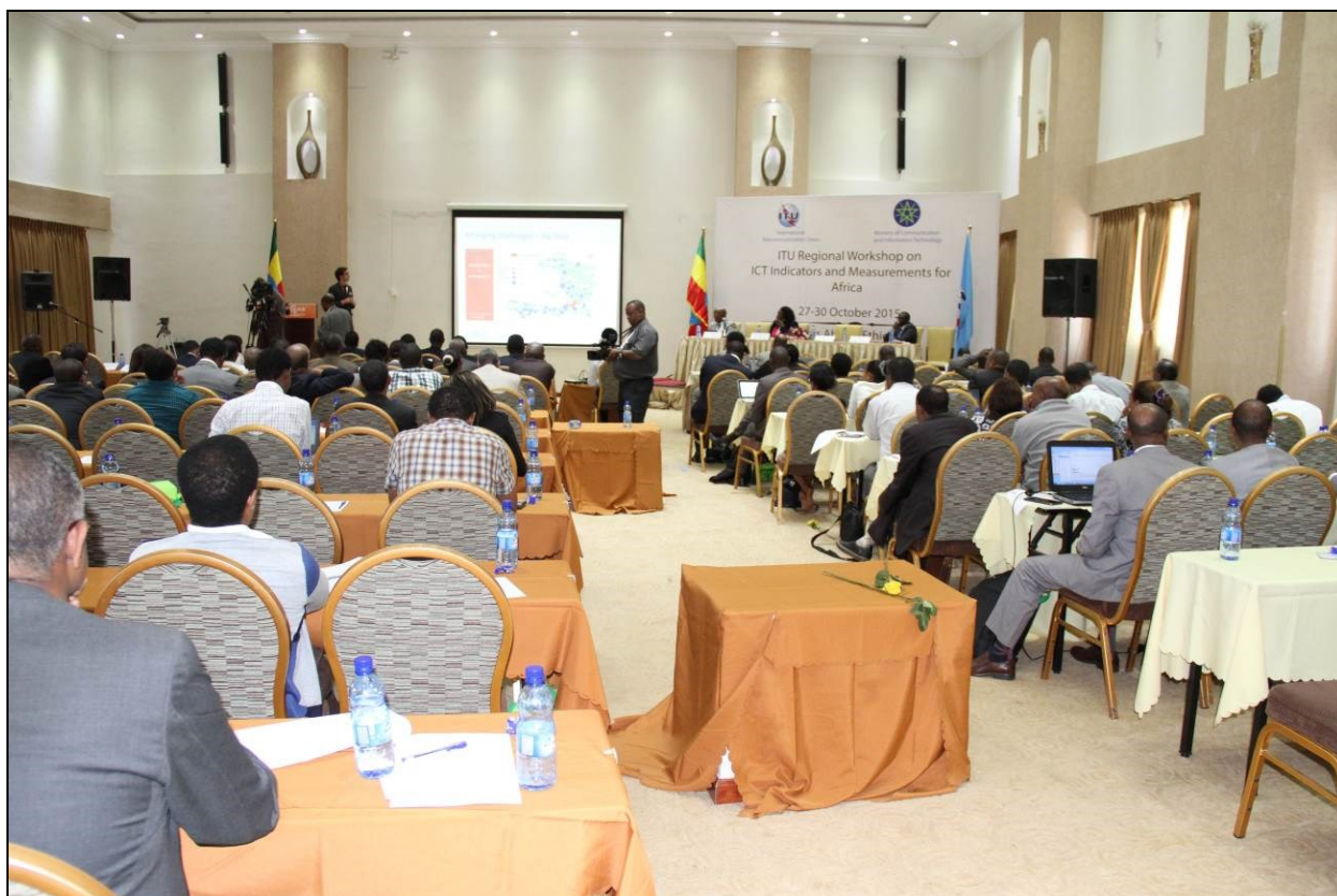
Presentations on the first day of the workshop.