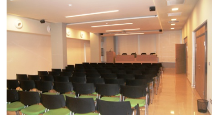
Salle de Réunion