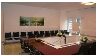
Salle de Réunion