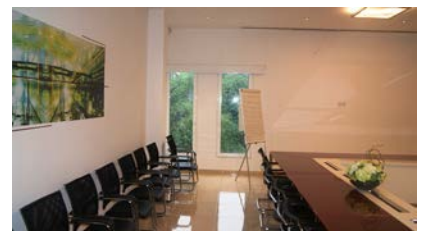
Salle de Réunion