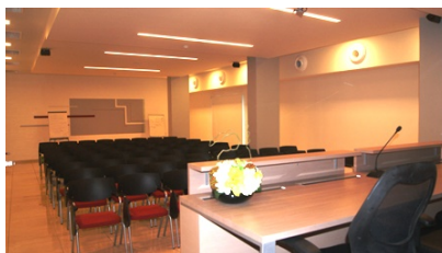
Salle de Réunion