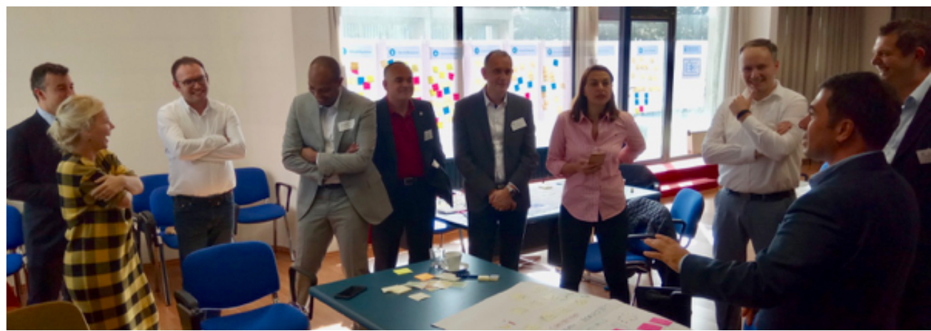
Session 10 impressions.