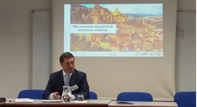
Session 1 impressions