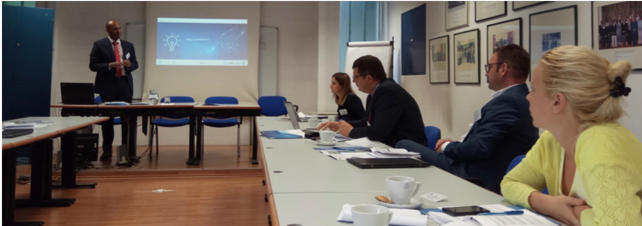
Session 2 impressions.