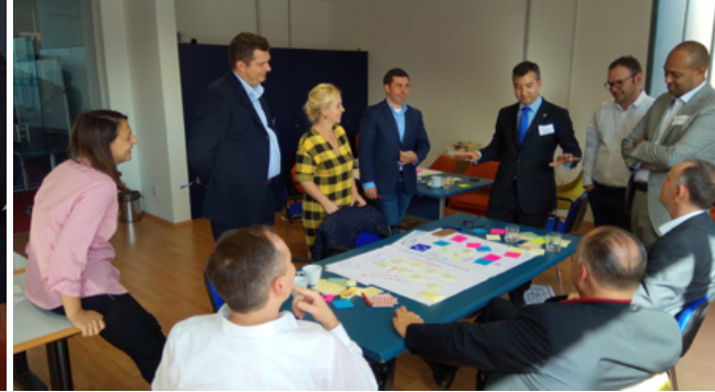
Session 9 impressions.