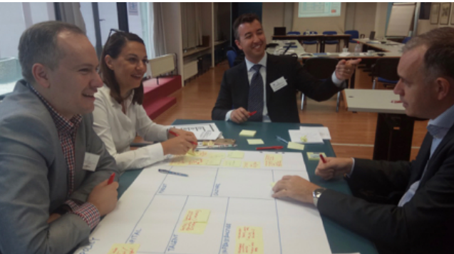
Session 3 impressions.