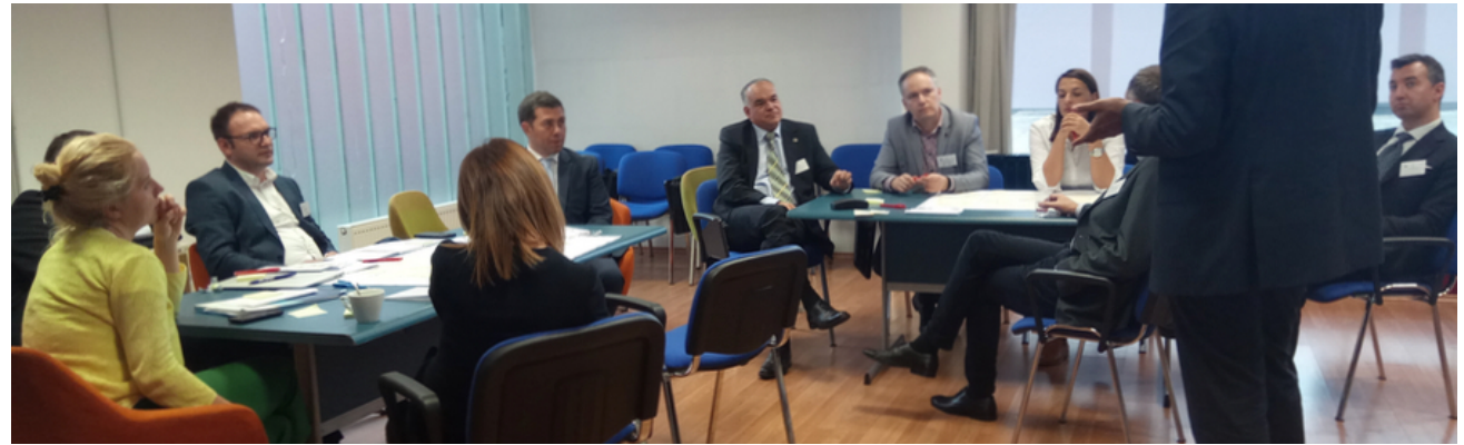
Session 5 impressions.