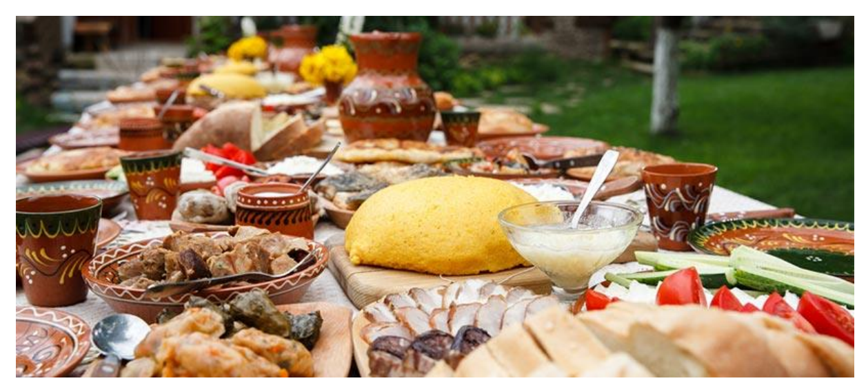
Moldovan cuisine

While traveling Moldova it is impossible to miss national cuisine. Many may find it similar to Romanian or other East European however, national culinary traditions infuse in it many distinct notes making its taste particularly delicious. Popular Local specialties include mititeyi (small grilled sausages with onion and pepper) and mamaliga (thick, sticky maize pie) which is served with brinza (feta cheese) and Tocana (pork stew).