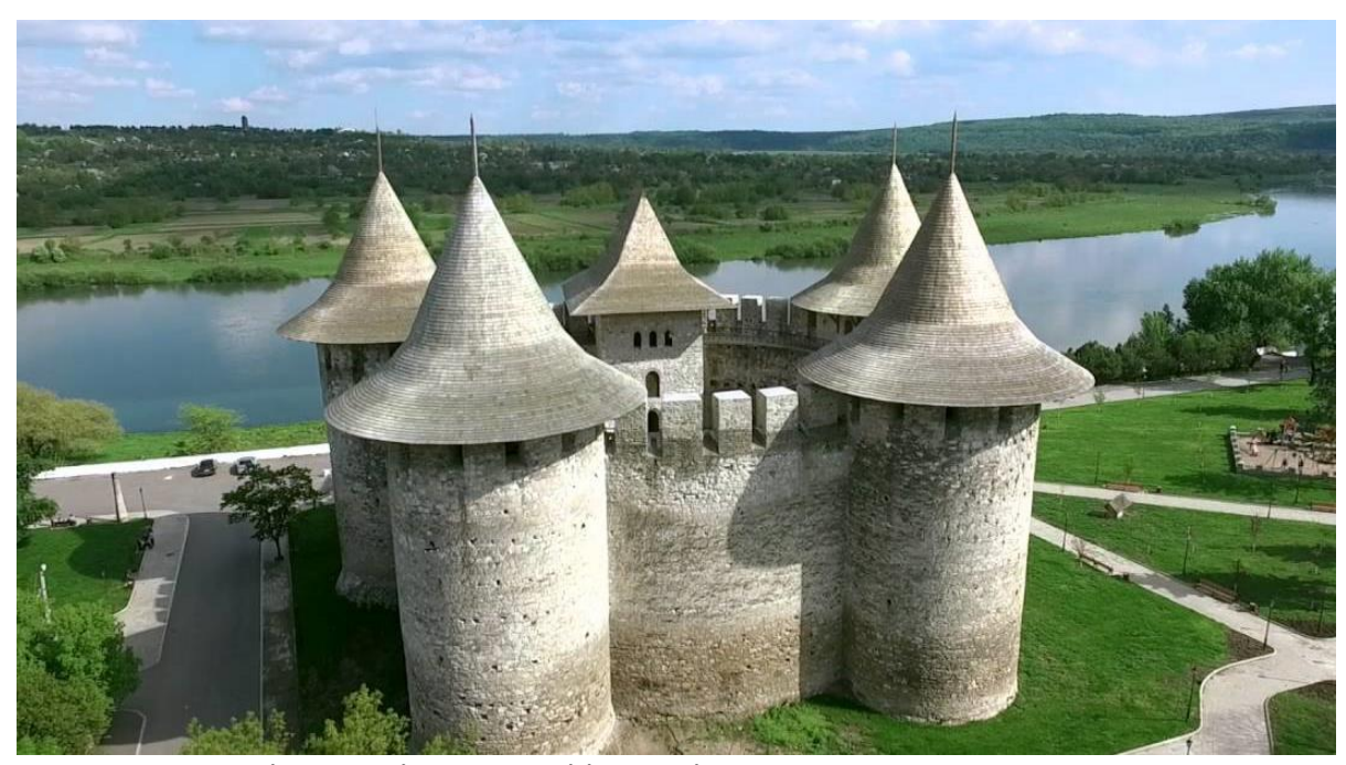
Cetatea Soroca: Photo credit www.moldova.md

Connoisseurs of deep culture may visit "National Museum of History of Moldova" and "National Museum of Ethnography and Natural History" where are present exhibits of multiple rare and even unique collections.