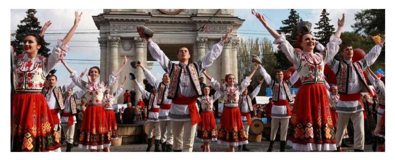
Traditional dance: Photo credit www.moldova.md