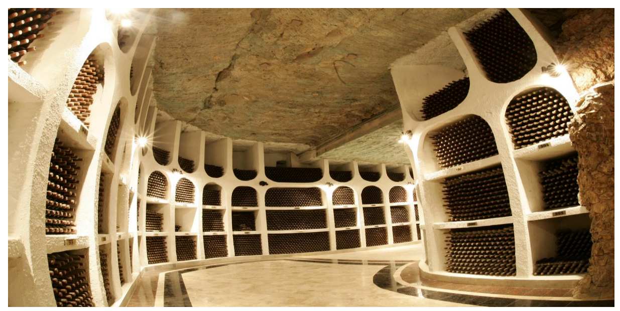
Cricova winery: Photo credit www.moldova.md

While traveling Moldova it is impossible to miss national cuisine. Many may find it similar to Romanian or other East European however, national culinary traditions infuse in it many distinct notes making its taste particularly delicious. Popular Local specialties include mititeyi (small grilled sausages with onion and pepper) and mamaliga (thick, sticky maize pie) which is served with brinza (feta cheese) and Tocana (pork stew).