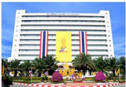
TOT Academy as the operational Centre