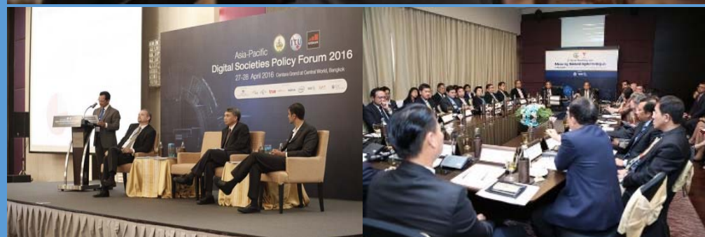
knowledge sharing & networking platform