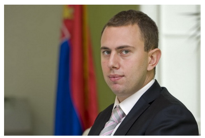
institutions and promotion of e-commerce.

University of Belgrade, Faculty of Electrical Engineering, published more than 160 papers in Proceedings of International and Domestic Conferences and International (IEEE Communication Magazine) and Domestic Magazines and as coauthor, the book "Access Networks". He is now with Republic Agency for Electronic Communications (RATEL) of the Republic of Serbia on position Director.