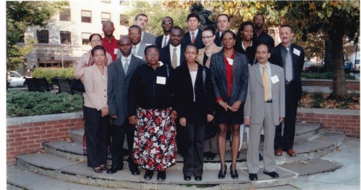
Regulatory & Privatization Issues in Telecommunications