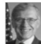
Tom Wheeler Chairman Federal Communications Commission