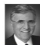
Honorable Harrison H. Schmitt, PhD Ambassador, Consultant and Director, Former Chair, NASA Advisory Council Former United States Senator & Astronaut