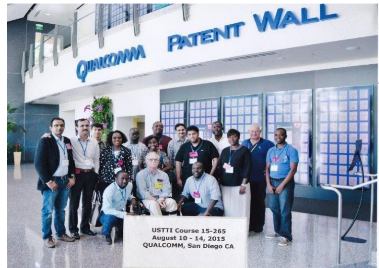
USTTI Course 15-265 August 10 - 14, 2015 QUALCOMM, San Diego CA