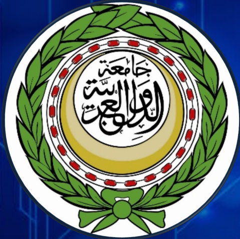
Arab Spectrum Management Group ASMG

The Arab Ministerial Council for ICT established the Arab Spectrum Management Group (ASMG) in 2001