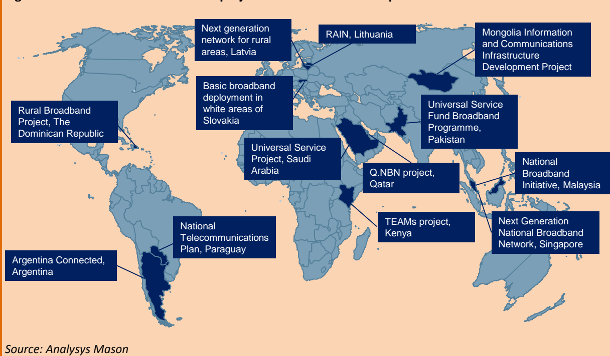
Figure 1: Location of PPP broadband projects considered in this report

This report discusses a total of 13 PPP projects. Figure 1 provides the name of each project and the country in which it is based. Brief details of the projects are provided below, while more detailed information can be found in Annex 1. A summary of the projects grouped by world region is provided in Annex 2, which contains the references that were used as information sources for each project.