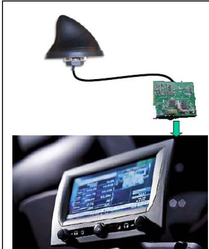
Figure 2: Example of a two-part solution for in-vehicle implementation of CALM