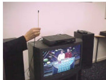
Figure 3 indoor reception with simple portable antenna

Currently mobile reception criteria are not yet defined in ITU and CEPT.