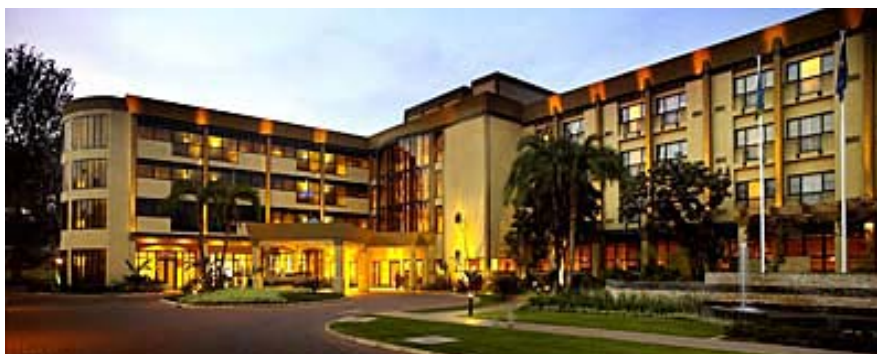
Serena Hotel: Venue for Connect Africa Summit